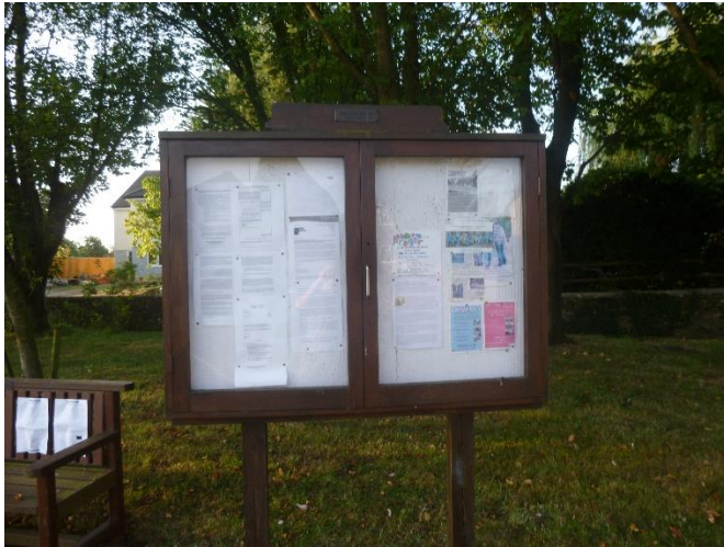
Stanton St Quintin Parish Council notice board is located on the central part of the land adjacent to Seagry Road