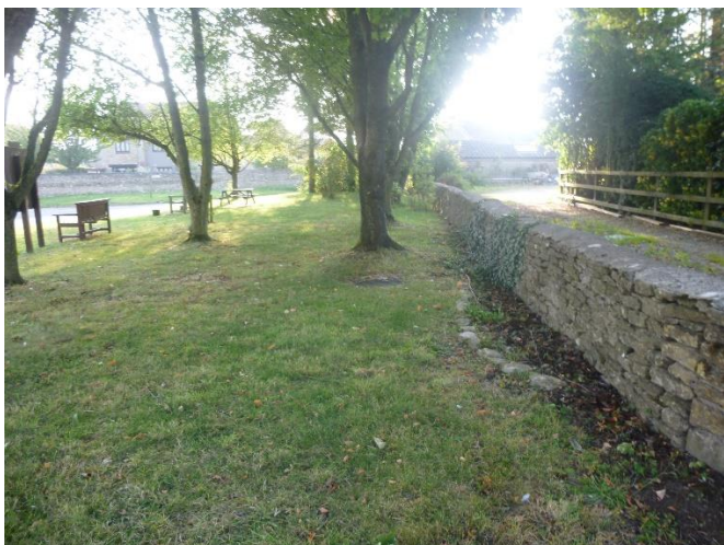
The application land looking east