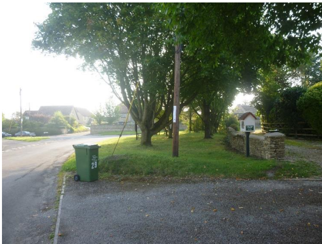
The application land looking east