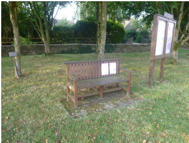
There are 2 memorial benches located on the land, a memorial tree, a table with benches as well as the lending library and the parish notice board