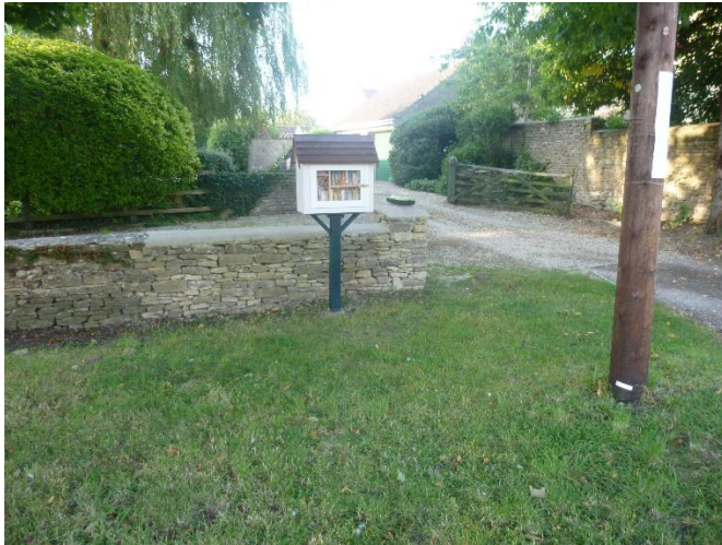
The "Wee Free Library" is located at the eastern end of the land