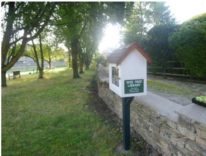
The application land looking east